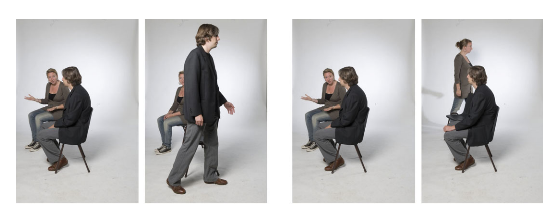
1. A girl was arguing with a boy. Subsequently... 2. The boy got really annoyed.