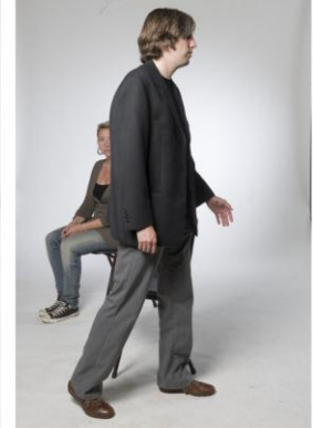
A girl was arguing with a boy. Subsequently... The boy got really annoyed.