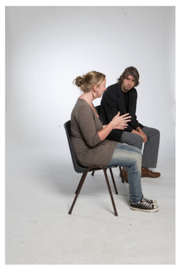
'Once upon a time there was a girl that had a conversation with a boy. The boy got really bored.'