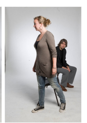
C: -linguistically salient; +visually salient