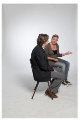
'Once upon a time there was a girl that had a conversation with a boy. The boy got really bored.'