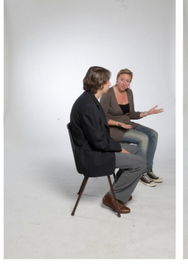
D: -linguistically salient; -visually salient